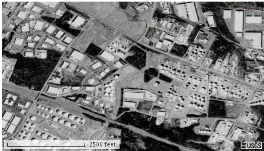
Example of AST signatures on a black & white aerial photograph