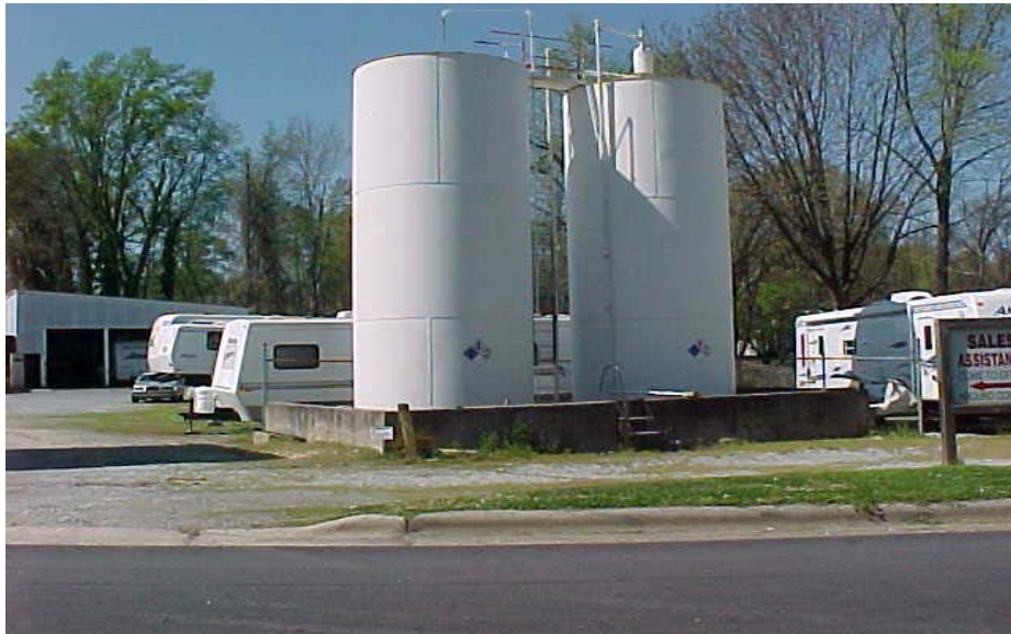
Example of 100+ gallon ASTs